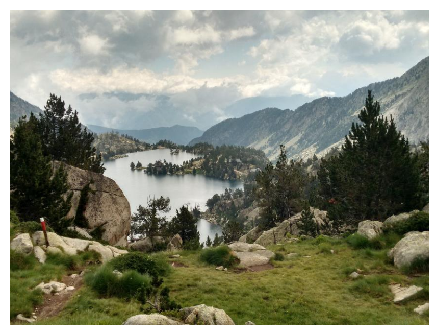
Spanish Pyrenees - Looking down on the Refugi JM Blanc - Ted Ashby

On the plus side, the trail was largely well marked and the scenery was always spectacular with lakes, impressive granite peaks and many streams. The weather was also kind with only one day requiring full waterproofs. Unfortunately, this coincided with the traverse of a very large boulder field and a couple of long snow patches but we made it to the hut in time to avoid being consigned to the third level of bunks.