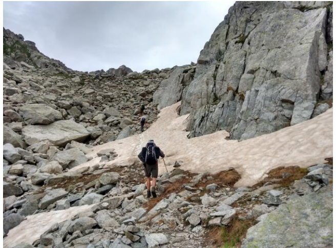
Snow patches on route