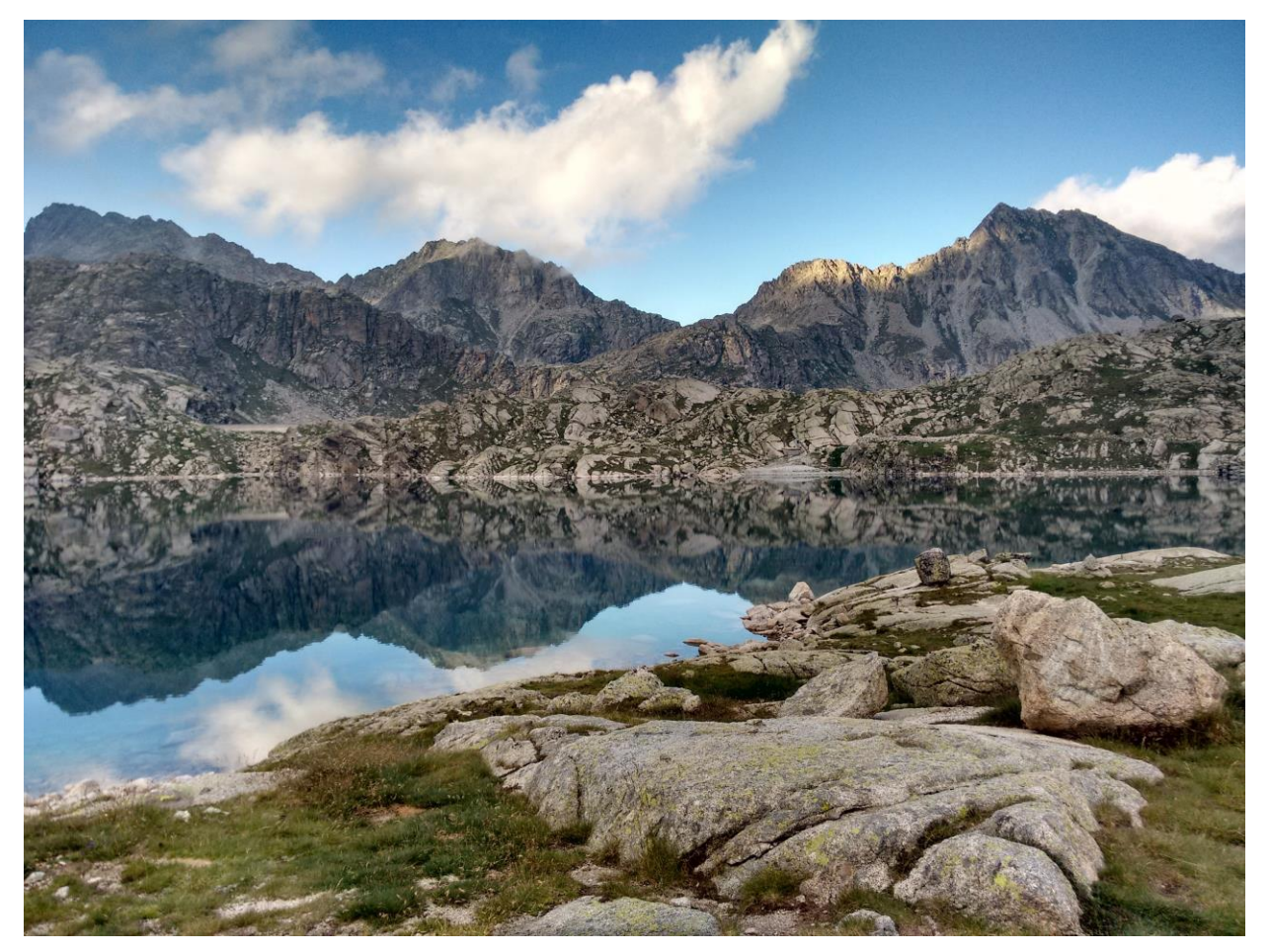
View from Refugi Colmina - Ted Ashby

Espot is one of the best villages to start from when doing the 'Carros de Foc'* tour of nine refugios in the Aiguestortes National Park. Unfortunately, it is not served by a direct bus service from Barcelona and our small group (myself, Kevin and Ken) were dropped by the side of the road leading up to Espot with instructions to be on the opposite side at 2pm the following Tuesday for a pick up after the tour. Faced with a 7km uphill walk on a hair-pin road in the mid-day sun we took the easy option and arranged a Landrover taxi up to the village for a quick lunch before another Landrover up to the start of the route and a walk to the first refugio .