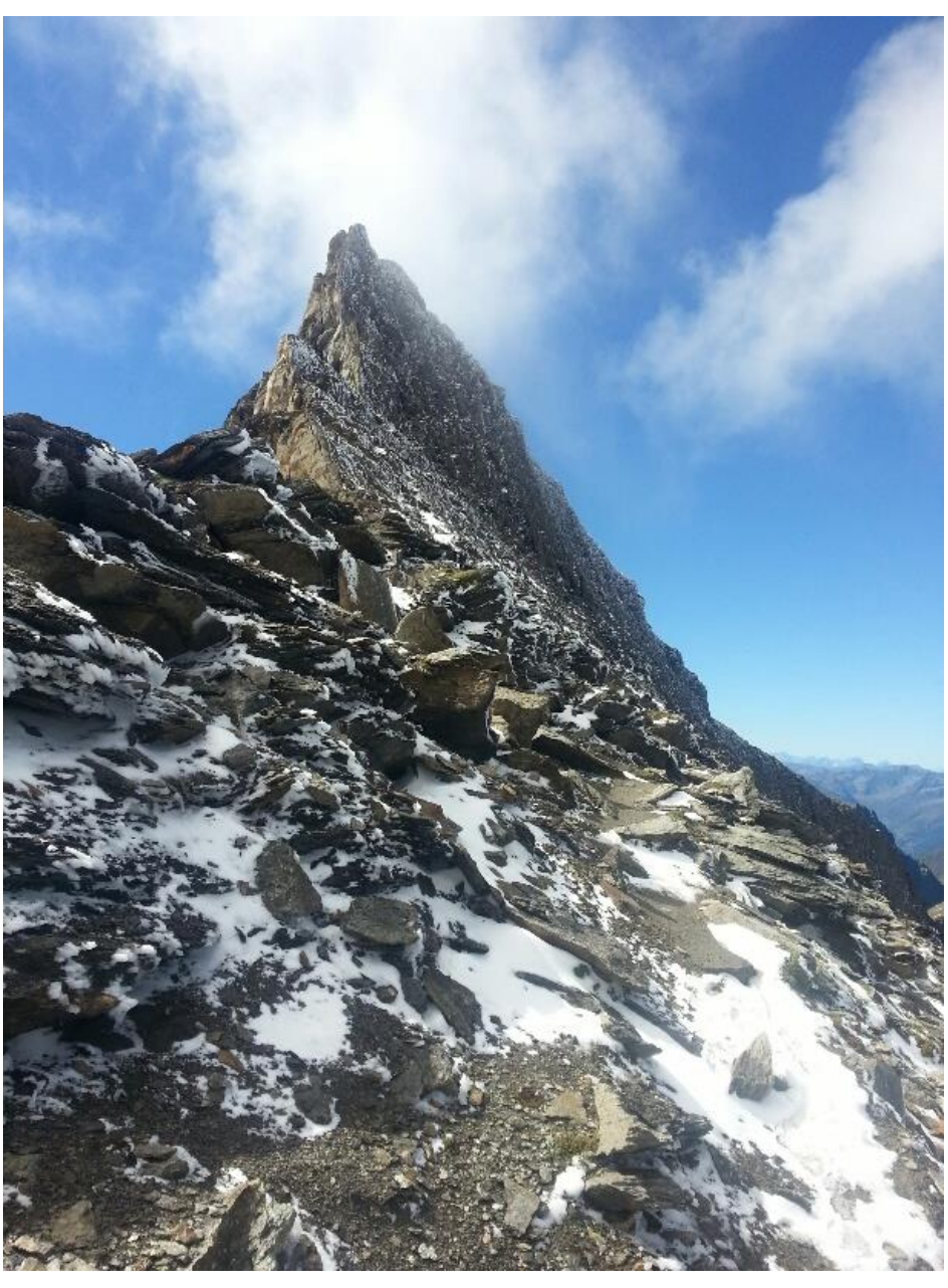
Großer Muntanitz: Leonie Cann

On our last day we set off north towards the Ponyhof and Kaprun, a grassy shoulder at first, then over a fence and a rocky ridge towards the village. After a couple of hours, we stopped for a breather and a snack, admiring the view over Zell am See and the Schmittenhöhe. In the distance were the limestone crags of the Steinernes Meer and the Kaisergebirge. Then off ever downwards through pine forests and the occasional meadow, eventually reaching the nursery slopes of Kaprun, a tiring descent of 1300m. After a late midday meal at a cafe, we got the bus back to Zell. Favourite huts: was it the Glorer and the Gleiwitzer? It certainly wasn't the Sudetendeutsche.